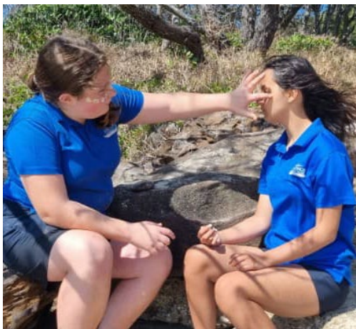
sense of belonging within the school