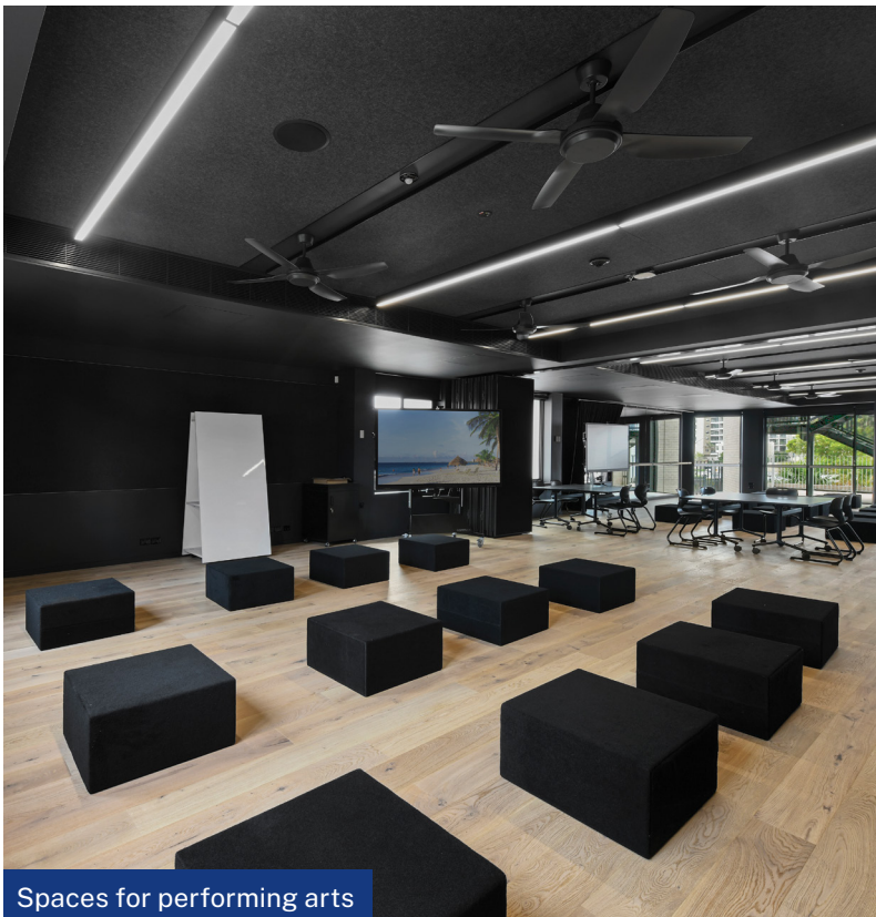
Spaces for performing arts